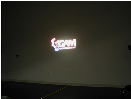
19° Lens Image - No Prismo™