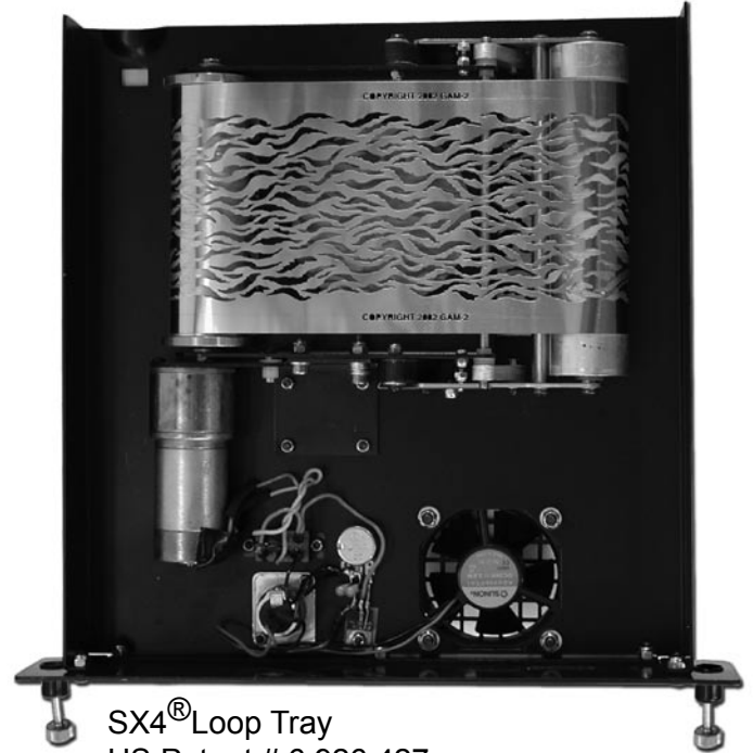
SX4® Loop Tray US Patent # 6,926,427 August 9, 2005

Ex: SX4® with 230 Volt Loop Tray ..... TS6102FS