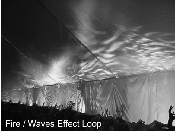
Fire / Waves Effect Loop